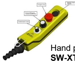
Hand pendant SW-XTR-HT10