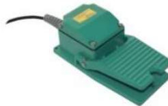
Optional H-duty foot control SW-10F with 10m of rubber cable