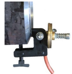
Optional Twin axis rotary welding earth SW-XYREC-300/400